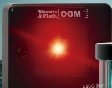
LX2-PT Port (RED) Running Light