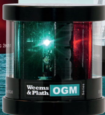
LXTA-P Tricolor/Anchor Combo with Photodiode