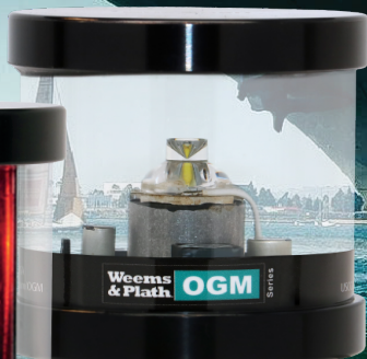
LXA-P All Around (WHITE) Anchor with Photodiode